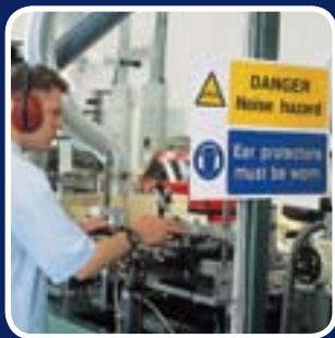
Tough vinyl for harsh environments