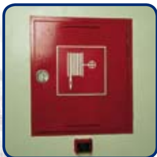
Identify fire fighting equipment and its location