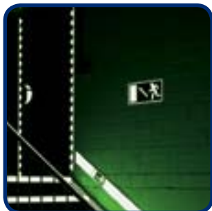
Make your escape routes visible in the dark