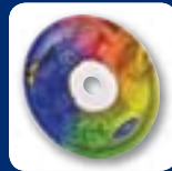
Surf On Signs™ (Page 23)