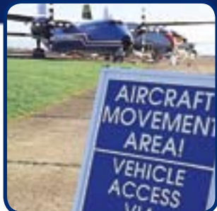
Make it clear, see it from a distance