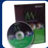
MarkWare™ (Page 22)