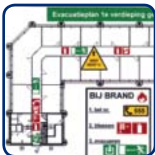
Print your Safety Procedures Wall Charts quickly and at a low cost