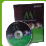
MarkWare™ (page 22)