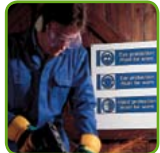
Make your workplace safer