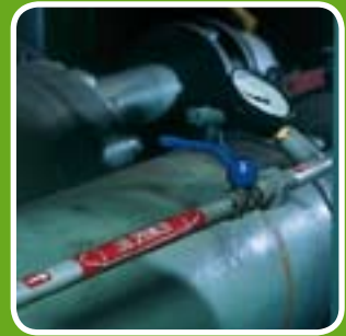
Identify pipes wherever they are