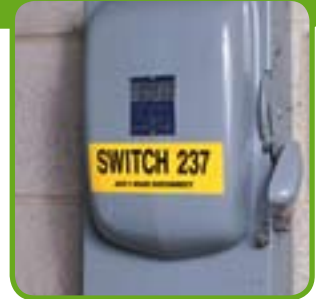
Panel & Switch I.D.