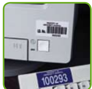
Asset identification labels