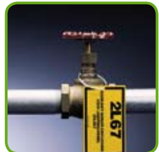
Type size from 2 to 42 mm. Secure your valves